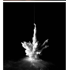
from top